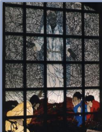
The Transfiguration of the Lord Sanctuary glass art