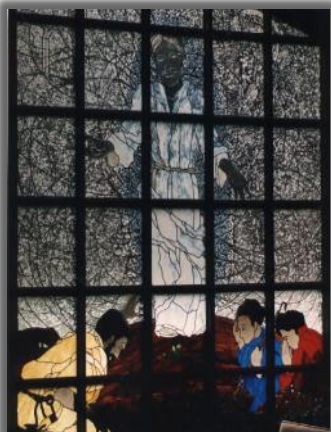
The Transfiguration of the Lord Sanctuary glass art