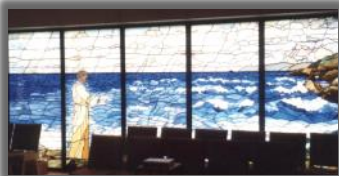
The Jesus Calms the Sea Chapel glass art